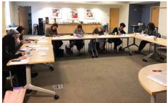
Volunteers and Research Interns participate in orientation to learn more about PPSNE.