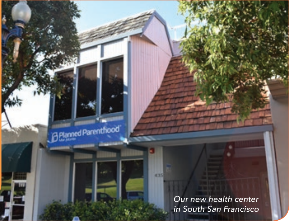
Our new health center in South San Francisco

By constantly showing your support and commitment to PPMM, you have been a crucial part of our work in the community, whether it's launching a major fundraising event, establishing a successful education program or opening a new health center. Check out just five of the important projects that we've been excited about recently: