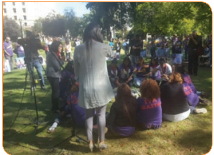
A group of janitors and survivors ends a week long fast after Governor Brown signed AB 1978. They celebrated and prayed together. Delores Huerta, labor leader and civil rights activist, is speaking to the group.

Get involved: ppactionca.org/ppamm_signup