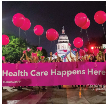
PPGT volunteers and advocates joined with tens of thousands in downtown Austin for the 2018 Pride Parade in August.