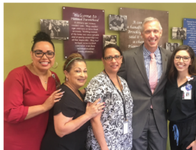
Staff at Southeast Fort Worth Health Center

Planned Parenthood has also expanded other services in Tarrant county, including increased teen pregnancy prevention outreach; PrEP and PEP HIV prevention services; and gender affirming hormone therapy in Arlington.