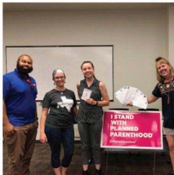
Fort Worth volunteers and supporters gathered in September to write letters and postcards to elected officials supporting healthcare.