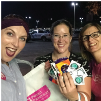
Waco-area volunteers handed out safer sex materials and information at the Welcome Back to College Condom Crawl in August.