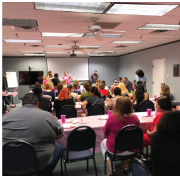
In August we hosted a Paint and Sip Period Kit Drive in Dallas to make more than 350 menstrual kits for people in need.

Connecting in our communities for a healthier Texas