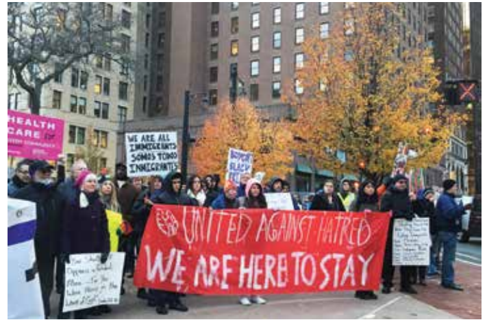
Shortly after the election, PPSNE participated in a rally organized by the CT Immigrant Rights Alliance (CIRA) to denounce hatred and racism in the country.