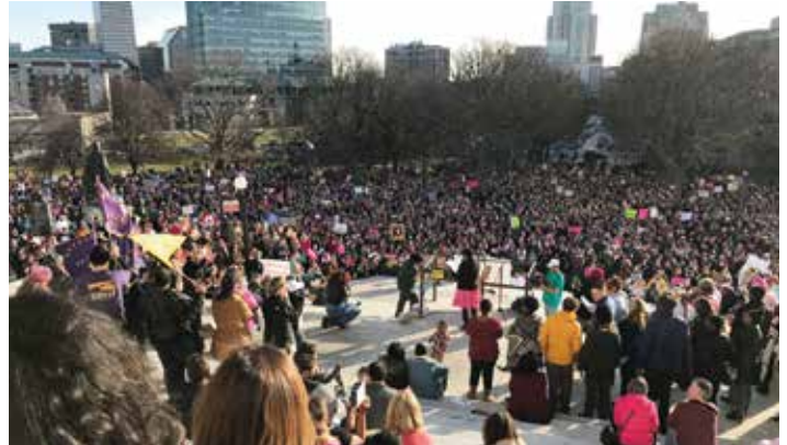
On January 21, PPSNE, community partners and thousands of advocates convened a Women's Solidarity Rally at the State House in Providence, RI.

This year, PPSNE and its coalition partners will be working closely with legislative allies, weighing policies that will protect the right to legal abortion for everyone, regardless of income.