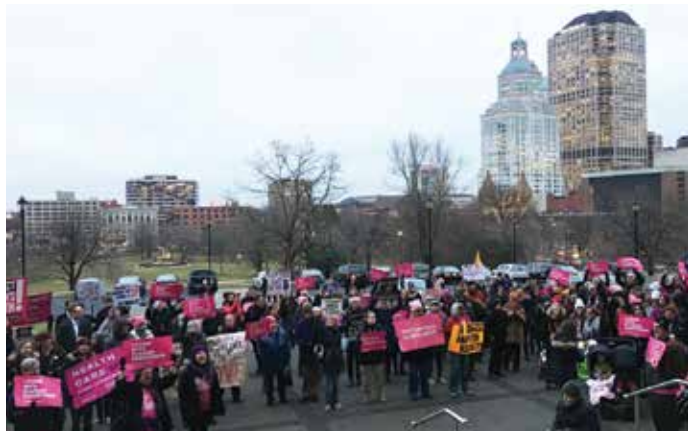
On January 18, PPSNE, the CT Coalition for Reproductive Choice and more than 250 advocates held a Reproductive Freedom People's Rally at the Capitol in Hartford, CT.

Your support is vital for all individuals who walk through our health center doors to access the health care they need. PPSNE will be relying on outspoken, supportive governors to sign legislation that will advance reproductive health, not restrict it. An overwhelmingly positive post-election response from advocates in both states has inspired us to believe that RI and CT can continue to be beacons of hope. This is the biggest fight ever to protect Planned Parenthood and access to reproductive health and rights. Millions of supporters are mobilizing to fight these attacks. Find out details about upcoming events by connecting with us on Facebook, Twitter and Instagram.