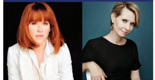
Actor Molly Ringwald, 2018 Fort Worth Luncheon Keynote Speaker (Left) and Actor Cynthia Nixon, 2018 Dallas Luncheon Keynote Speaker (Right)