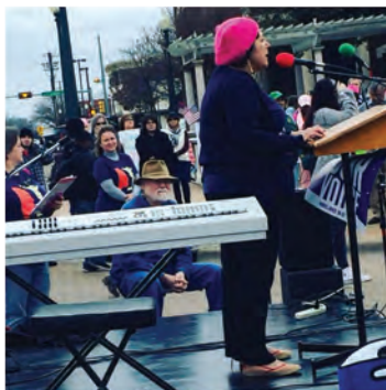
Volunteers and supporters gathering at the Women's March on Waco.