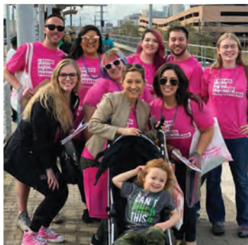
Volunteers promoting PPGT health services at the St. Patrick's Day Parade in Dallas.

Connecting in our communities for a healthier Texas