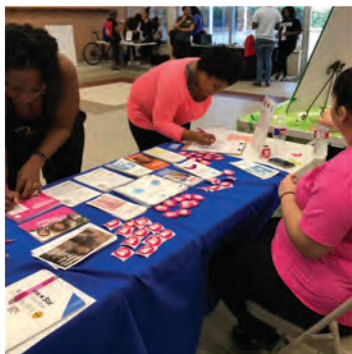
Planned Parenthood volunteers attending the Urban Health Expo at Huston-Tillotson University in Austin.