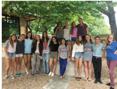
Youth LEAD Training in Austin, April 2017

To learn more, visit: ppgreatertx.org/youthlead