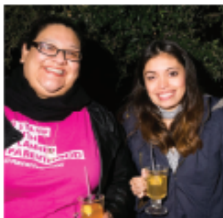
Fort Worth supporters came together at the Public Cervix Announcement benefit concert in November.