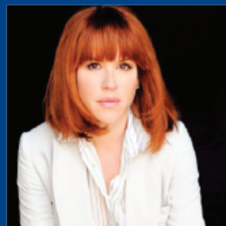
Actor Molly Ringwald, 2018 Fort Worth Luncheon Keynote Speaker.

Advance reservations required and sponsorships available. Please call 855.314.0799 ext 10183 or email events@ppgt.org for more info.