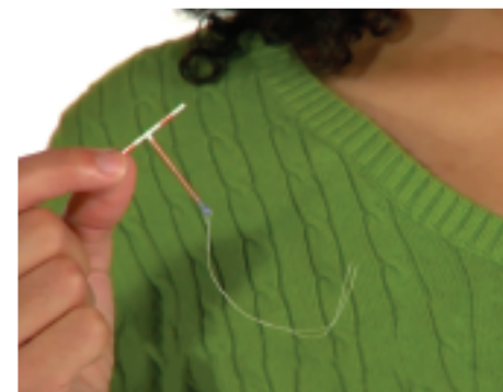
Image from a recent Planned Parenthood IUD advertisement.

pregnancy-related medical costs (Guttmacher Institute).