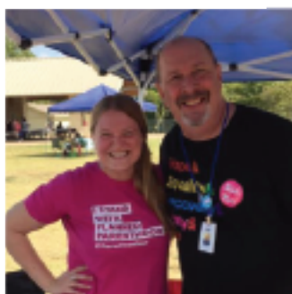
Planned Parenthood staff and volunteers attended the Waco Pride Festival in October.