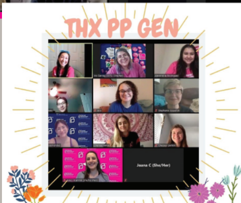
Right: PPGen virtual brunch event lead by college student leaders.

Every day, Planned Parenthood's community outreach programs are building relationships with parents, students, and supporters. Planned Parenthood of Greater Texas staff provide an engaging and relevant virtual programming calendar.