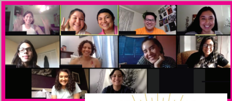
Above: Participants of Frontera Folx—a PPGen group.

Making a healthier Texas by connecting with communities in central, east, north and west Texas.