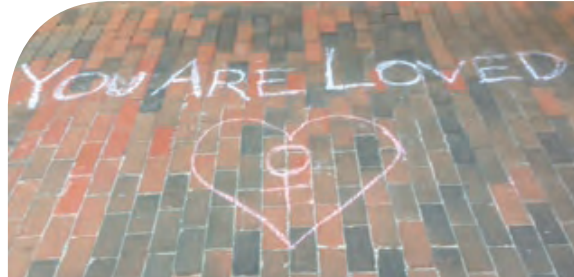
An unknown, wonderful supporter chalked this outside of our Portland health center following the election.

It's times like these that we rely on you.