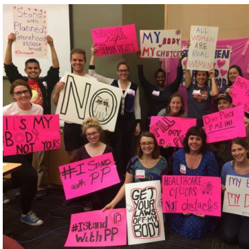
Planned Parenthood volunteers show off signs made for the One Resistance and Women's March on Austin.