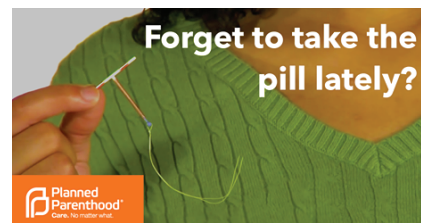
Image from a recent Planned Parenthood ad promoting IUDs.

remember to take a pill or pick up refills.