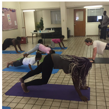
Attendees at the Planned Parenthood Healthy Community Block Party in Waco participate in a free yoga class.