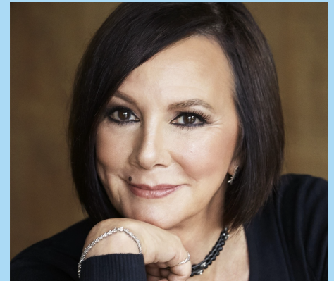
Dallas Annual Awards Keynote Speaker, Marcia Clark

To learn more or sign up to participate please visit ppgreater.tx.org/youthlead .