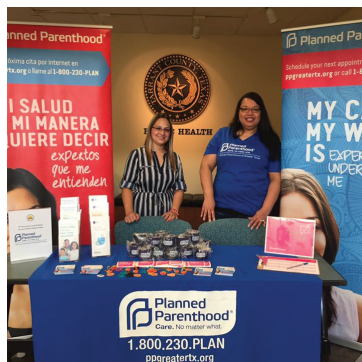
Planned Parenthood health center managers at the Annual Carnaval de Salud in Fort Worth.