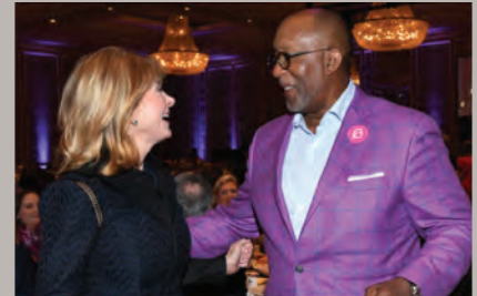
Former state senator Wendy Davis and former Dallas mayor Ron Kirk at the Dallas Luncheon on March 6th. More coverage at papercitymag.com .

Advance reservations required and sponsorships available for events. Email events@ppgt.org for more info.