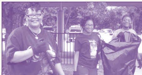
PPIN staff and volunteers came together to help beautify the Georgetown health center at a Landscaping Day in August.