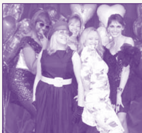
PPIN staff, supporters and volunteers donned their best 80s duds at the second annual PPYL 80s Prom: A Safe Sex in the City Event on Feb. 12.