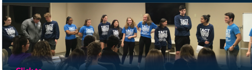
Click to see TACT in action

Planned Parenthood provides expert sex education to teens and parenting adults to provide the resources for young people to be healthier and safer.