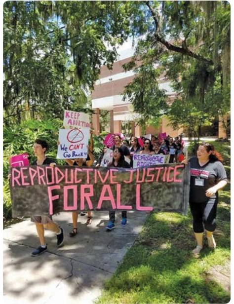
Participants at this year's Youth Power Summit

That's why we're actively investing in our young volunteers and campus chapters. This summer, more than 75 young activists came together at the University of Florida in Gainesville to train in storytelling and organizing. After taking part in Planned Parenthood Generation Action's Youth Power Summit, they left with new skills and work plans to implement strategic campaigns in their communities. Locally, we also hosted our second Speakers Bureau training in Kissimmee, lifting up the voices of 12 patient advocates.