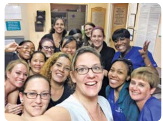
Staff from Sarasota and Manatee after mastering their rollouts of MTD 2.0

This June, MTD 2.0 came to the Kissimmee and Lakeland health centers. In the two day on-site training experience, staff from the East Orlando health center were on site to guide and support their fellow staff through the implementation of the changes. Once again, the results were remarkable: staff were able to see a total of almost 3.5 visits per hour compared to a pre-MTD average of 2.5, and decreased their total average cycle time.