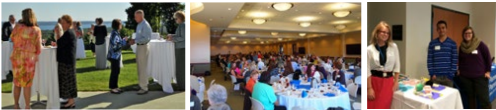
After successful spring events in Grand Rapids and Marquette, PPWNM celebrated its Healthy Families fundraisers in Petoskey, Traverse City, and Muskegon (left to right) in the summer and fall.