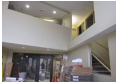
New entrance in Grand Rapids.