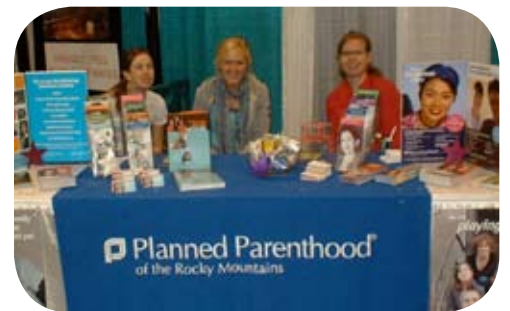
Outreach volunteers at the Colorado Women's Expo

14 percent of PPRM's current staff was once volunteers.