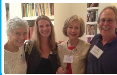
Choice Affairs Arty Party

Five out of the 11 Denver area Choice Affairs events are sold out! Get your tickets now at www.pprmchoiceaffairs.org or by phone: 303.813.7640 to reach PPRM's Manager of Events directly. All ticket sales benefit PPRM's Responsible Sex Education Institute.