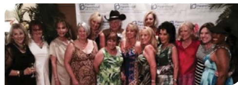
5th Annual Corks & Forks