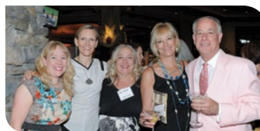
5th Annual Corks & Forks