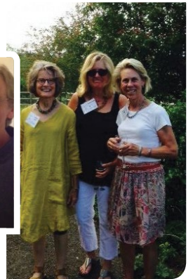
Choice Affairs Pedal Pushers