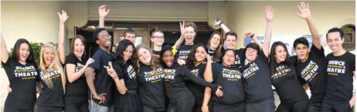
SOURCE Productions put on a high-energy show for our annual dinner guests.