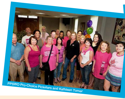
PPSWO Pro-Choice Picketers and Kathleen Turner

Film and stage actress Kathleen Turner was in Cincinnati for a few weeks last fall appearing in a play entitled High . Ms. Turner serves on Planned Parenthood Federation of America's (PPFA) Board of Advocates; while in town she truly stepped up to the plate advocating on behalf of PPSWO. Ms. Turner graciously joined a pro-choice rally in front of the Elizabeth Campbell Center with many PPSWO volunteers to counter the anti-choice commencement of 40 Days for Life . In addition to walking in the 90 degree heat, Ms. Turner also conducted two interviews with the media and produced a Public Service Announcement promoting our vital health services.