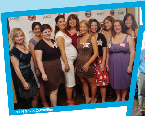
PUSH Group Committee