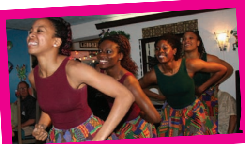
DCD Company II

The July 11th event at Below Zero Lounge was as hot as the nearly 100-degree summer day. Lizz said she enjoyed our city and hopes to return. Please visit her internet blog ( http://lizzwinstead.com or tour4pp.wordpress.com ) to view photos from the event and learn more information on the tour.