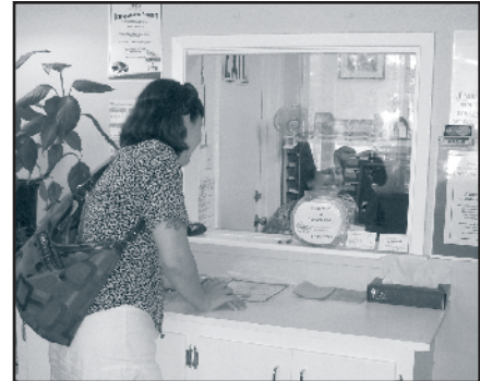
A patient checks in for an appointment at the Weaverville Health Center

In addition to serving those people who come to the health center, the staff in Weaverville reaches out to the community by distributing condoms in Hayfork, putting up posters throughout the county, and teaching reproductive health in most of the local schools.