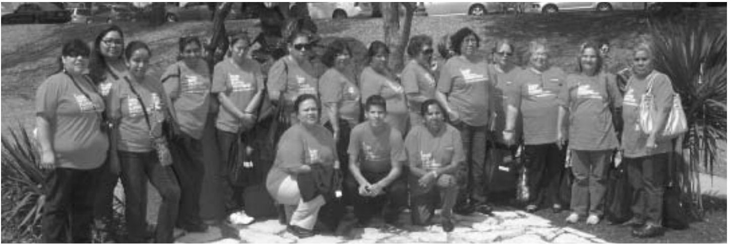
Advocates from the Lower Rio Grande Valley