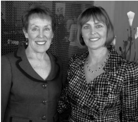
Annual Dinner honorees Hon. Betty Castor and Rep. Kathy Castor