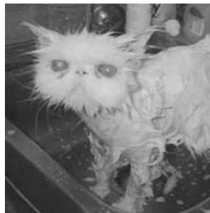
Please don't wash my pet!

There is still time to make your pet a "PPSI Choice Pet!" In place of the standard mid-year appeal, PPSI is giving donors the chance to NOT have us wash their pet, while still supporting the Planned Parenthood mission. And