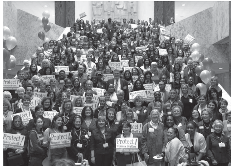
Family Planning Advocates members and supporters rally in the Well at the Legislative Office Building

New York State's legislature officially convened in Albany on January 10 this year, and Planned Parenthood was there to show lawmakers that reproductive health and rights demand their attention. 23 PPSFL staff and volunteers joined a crowd of over 340 supporters from Family Planning Advocates (FPA) and sister affiliates throughout New York for the day of action.