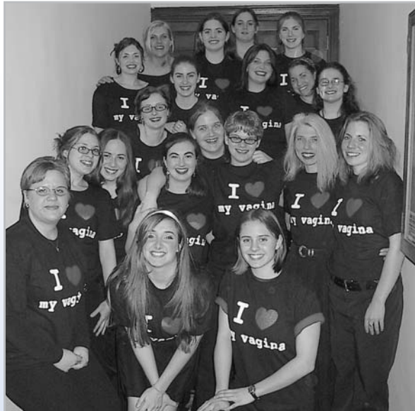
The cast of the Elmira College performance of Eve Ensler's The Vagina Monologues stands for a photo before the start of the show. The cast inspired an audience of over 100 with the serious, quirky and laugh-out-loud monologues.

PPSFL is now engaged in a thoughtful strategic planning process. As part of a movement that recognizes sexual rights as fundamental human rights, we are examining our role as a leader for social change. Together with our supporters, we will achieve our vision for society by putting our values into action—by, as Gandhi said, being the change we wish to see in the world.