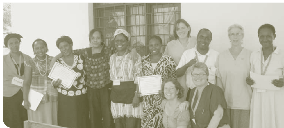
Grounds for Health volunteers and newly trained medical providers.

Grounds for Health is a non-profit supported by specialty coffee companies, national and regional ministries of health, and local coffee cooperatives. Its goal is to create sustainable and effective cancer prevention programs with a focus on early diagnosis and treatment of cervical cancer.