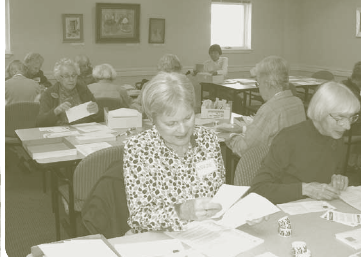
Volunteers at Kendal at Hanover