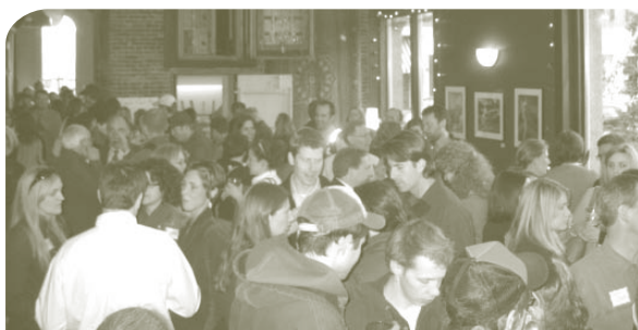
More than 300 people learned about Good Chemistry at Greendrinks in Portland, ME.

We are working toward the goal of “doing no harm” with our practices by ensuring that we