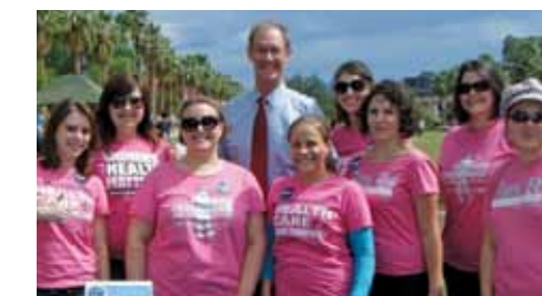
Election volunteers with Attorney General Terry Goddard

During the 2010 election cycle, Planned Parenthood Advocates of Arizona (PPAA) Board members, staff and volunteers put in more than 1,000 hours, dialed 7,802 phone numbers, and reached 145,159 voters through our mailings. A huge "thank-you" goes out to everyone who worked so hard this election season — you made a difference.