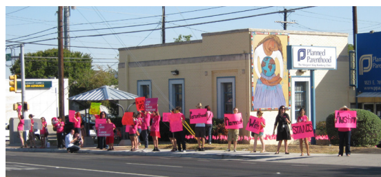
Volunteers rally in support of the E. 7th Street health center.

Cecile Richards, President of Planned Parenthood Federation of America, met with staff and supporters of Planned Parenthood at our E. 7th Street health center on Sept. 23 to thank them for continuing to provide essential health care services despite elimination of all government funding for the health center as a result of Governor Perry's new budget.