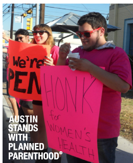
Volunteers at a rally in support of the E. 7th Street health center.

Texas Governor Rick Perry's budget singled out women's health for severe cuts—eliminating more than 2/3 of funding for basic women's health care and family planning. As a result Planned Parenthood's E. 7th Street health center lost all of its government funding that provided free, life-saving health screenings and birth control to more than 4,000 Austinites annually. When we turned to you for help, more than 700 of you reached into your pockets to donate to provide free life-saving health exams and birth control to clients who depend on our E. 7th Street health center. As of Dec. 5, 289 clients have received free health exams funded 100% by these donations.