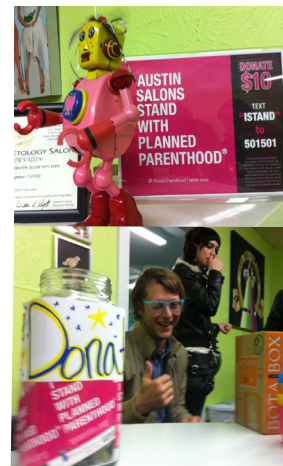
Hearts and Robots Salon held a clothing swap and collected donations for Planned Parenthood.

Austin community partners have also come out in full force to support Planned Parenthood. As a part of the Austin Stands with Planned Parenthood campaign, six Austin salons donated a portion of their proceeds to Planned Parenthood. Hearts and Robots Salon also held a clothing swap benefit. Thank you to Hearts and Robots, Platypus, Vain, Fringe, and Wet salons for supporting Planned Parenthood's E. 7th Street clients.