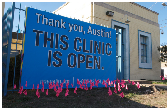
Pink flags represent donations to the Austin Stands with Planned Parenthood campaign.

Cecile Richards, President of Planned Parenthood Federation of America, met with staff and supporters of Planned Parenthood at our E. 7th Street health center on Sept. 23 to thank them for continuing to provide essential health care services despite elimination of all government funding for the health center as a result of Governor Perry's new budget.