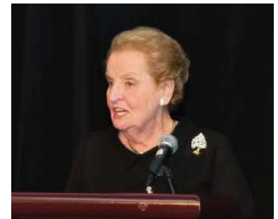
Former U.S. Secretary of State Madeleine K. Albright