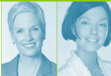
Cecile Richards Ashley Judd