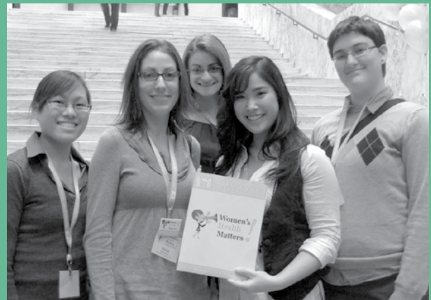
PPHP volunteers show their support for reproductive health in Albany.