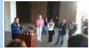
On January 22, as a crowd gathered at the State Capitol Rotunda to commemorate the 37 th anniversary of Roe v. Wade, we celebrated 40 Years of Reproductive Rights. Three years before Roe, in 1970, Hawaii became the first state in the nation to legislatively decriminalize abortion.