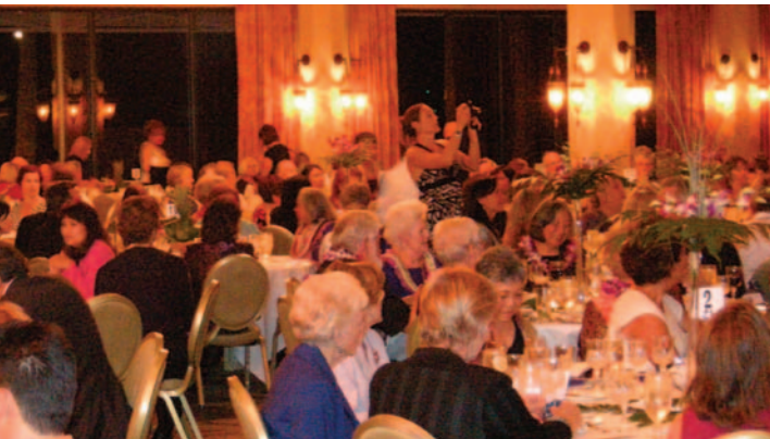
Guests enjoy a sumptuous dinner

Premium level sponsored tables and tickets are still available. Call Sheila O'Keefe at 589-1156 ext. 225 or email sokeefe@pphi.org to order yours now.