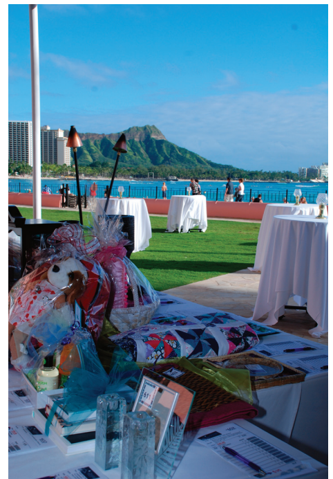
The Silent Auction and incomparable Waikiki

Premium level sponsored tables and tickets are still available. Call Sheila O'Keefe at 589-1156 ext. 225 or email sokeefe@pphi.org to order yours now.