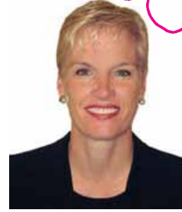
President of PPFA, Cecile Richards

SAVE THE DATE with Cecile: Champions of Choice — 45 Years Serving Hawaii