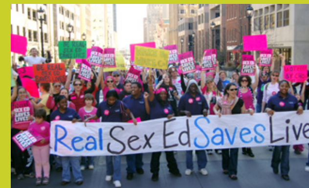
Planned Parenthood supporters in Raleigh, NC.