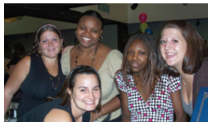
Several graduates of our Adolescent Parenting Program.

When parents speak openly about sexuality, their children learn to do likewise. Young people who confide in their parents become better able to refuse sexual advances and more likely to delay too-early sexual activity.