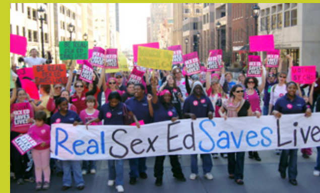
Planned Parenthood supporters in Raleigh, NC.