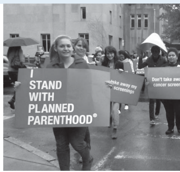
2011 NY State Vox Conference demonstration in Ithaca